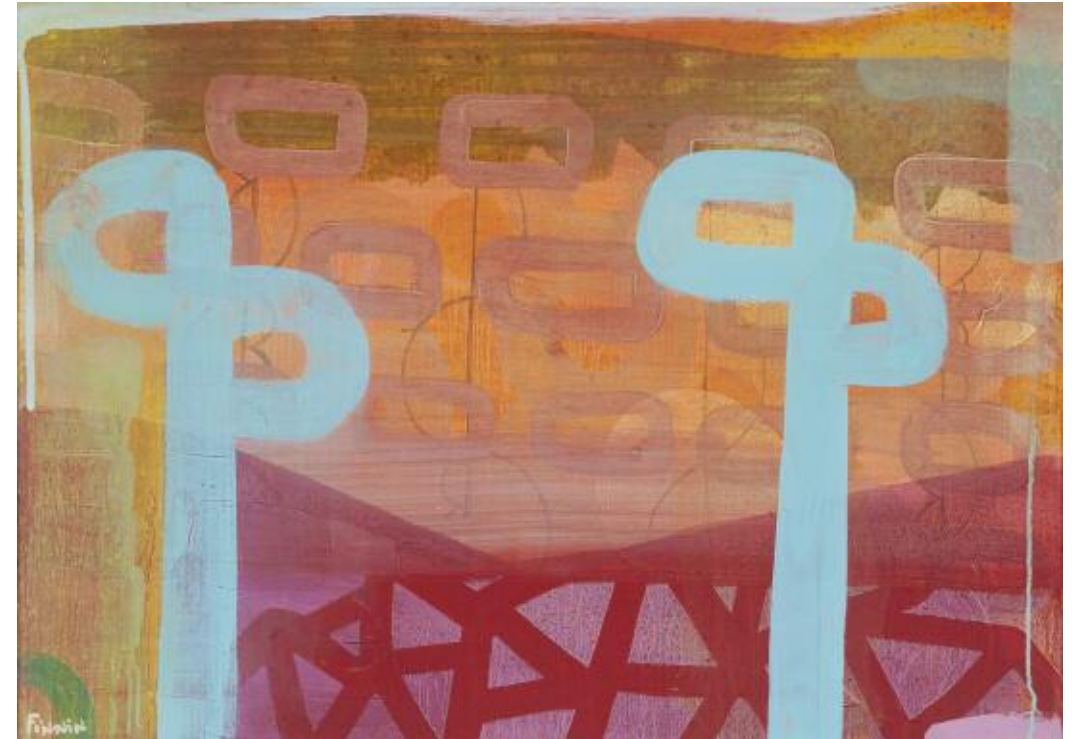
The Crooked Path of the Puritans 19¼ x 27¼ ins 50 x 70.5 cms oil on canvas