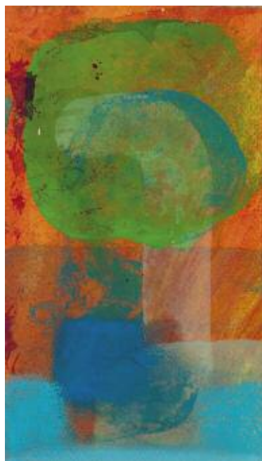
Five Studies for a Recurring Space I 10¼ x 6 ins 26 x 15 cms acrylic and pigment on paper