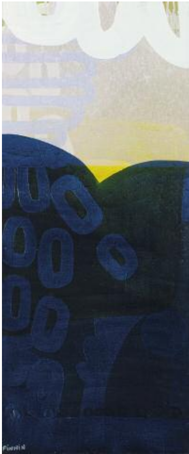
Unseen Rain 27½ x 12 ins 70 x 30.5 cms oil on canvas