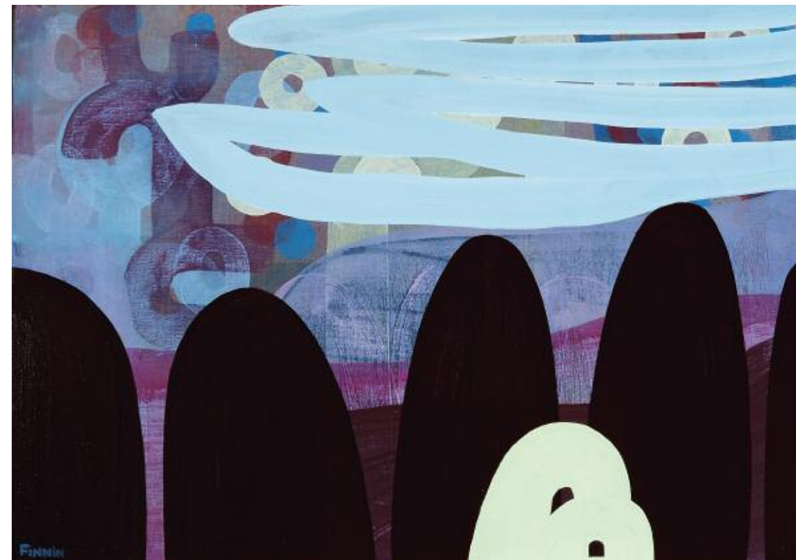
The Fabric of Faceless Thoughts 19¼ x 27¼ ins 50 x 70.5 cms oil on canvas