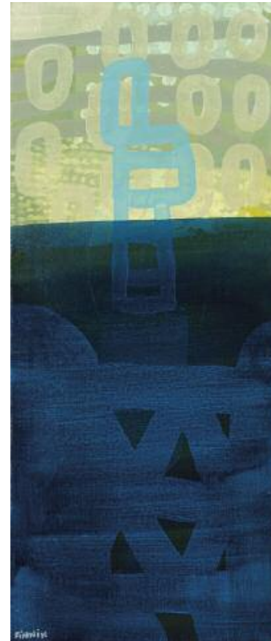
The Pear and the Saviour 27½ x 12 ins 70 x 30.5 cms oil on canvas