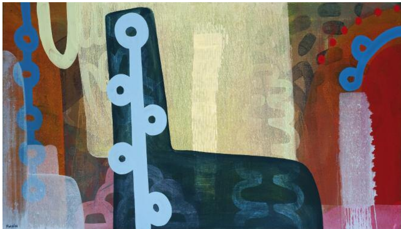
The Inner Life of Marigolds 27¼ x 55¼ ins 70.5 x 140.5 cms oil on canvas