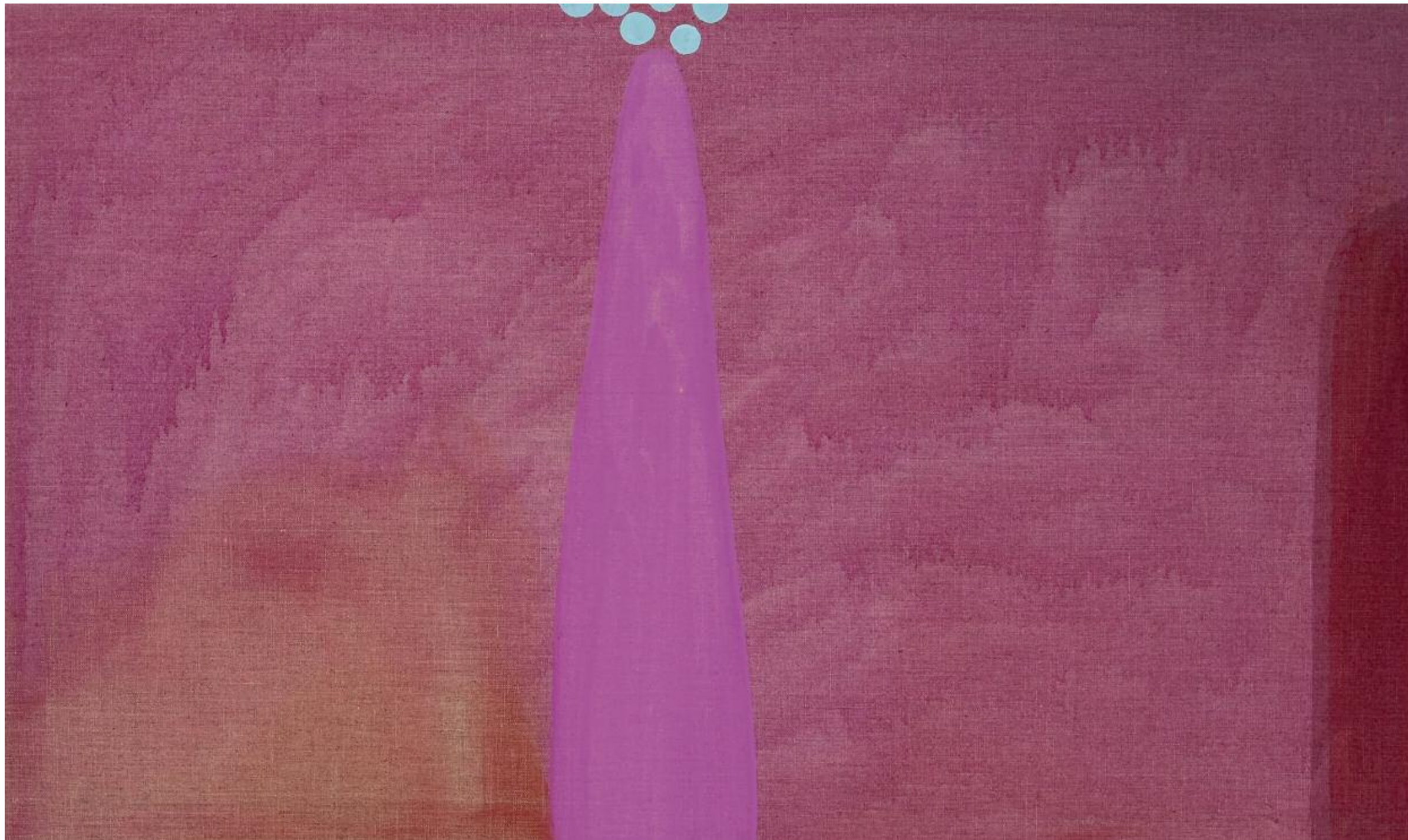
The Other One Never Came 23¾ x 55¼ ins 60.5 x 140.5 cms oil on canvas