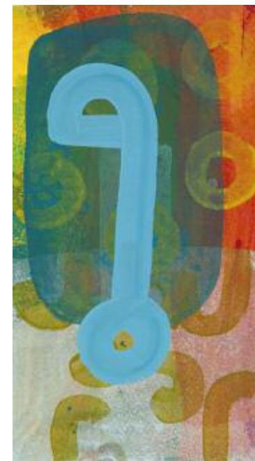
Five Studies for a Recurring Space III 10¼ x 6 ins 26 x 15 cms acrylic and pigment on paper