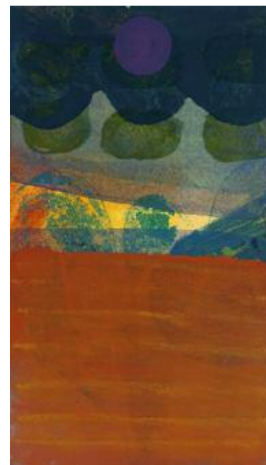
Five Studies for a Recurring Space V 10¼ x 6 ins 26 x 15 cms acrylic and pigment on paper