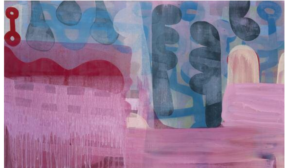
Unlike Other Days 23¾ x 55¼ ins 60.5 x 140.5 cms oil on canvas