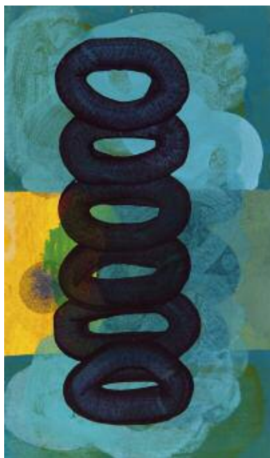
Five Studies for a Recurring Space II 10¼ x 6 ins 26 x 15 cms acrylic and pigment on paper