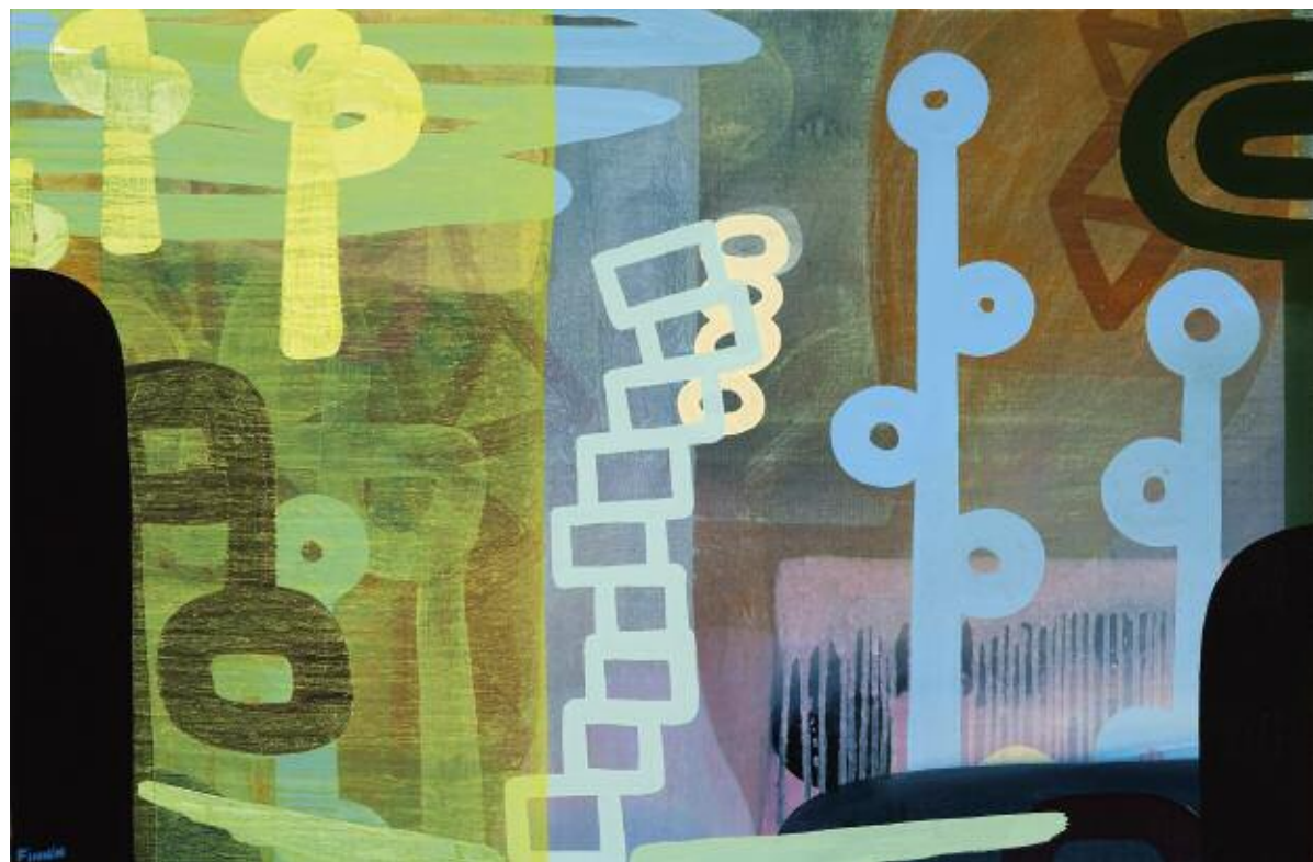
Boy Racers and Spring Onions