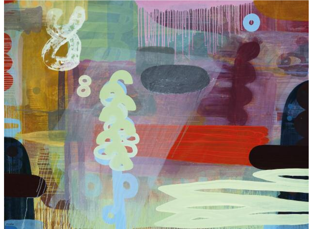
49 Ox Hides and a Lump of Faith 55¼ x 63 ins 140 x 160 cms oil on canvas