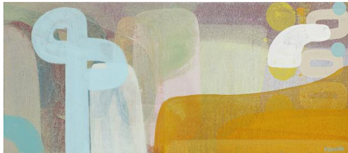
My Life as a Lettuce Labeller 12 x 27.5 ins 30.5 x 70 cms oil on canvas