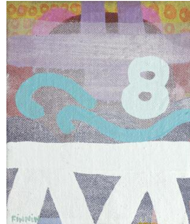
The Making of Pet Eights I 12 x 10 in 30.5 x 25.5 cms oil on canvas