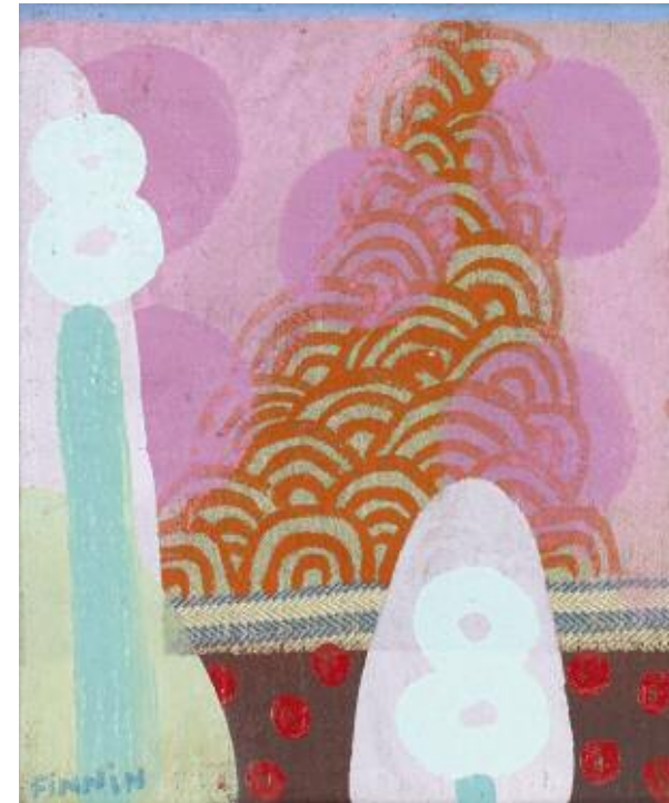
The Making of Pet Eights III 12 x 10 in 30.5 x 25.5 cms oil on canvas